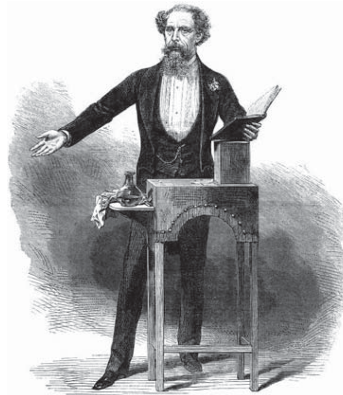
An engraving of the author titled “Mr. Charles Dickens' Last Reading”

Pip is not the only character who achieves self-knowledge. Miss Havisham and Estella also learn through suffering. In her insane obsession with vengeance, Miss Havisham has selfishly deprived herself and her two young “playthings” of love, friendship and happiness. Pip comes to understand and graciously forgives her. At the end of the novel Pip and Estella stand, wisely and hopefully, on the threshold of a new beginning. ☞