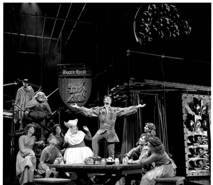
Classic Players, 1999

Finally, the production design for The Shadow of Succession places the action in all of history rather than in one actual historical period or place. Although the events that inspired Shakespeare's plays about Henry IV spanned only a single historical decade, the opposition they portray between parents and children, war and peace, order and chaos, duty and pleasure, reason and passion are universal. Shakespeare invites each playgoer to find his own world within the vast universe of Henry IV.