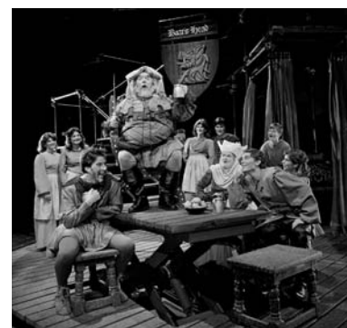
Classic Players, 1999