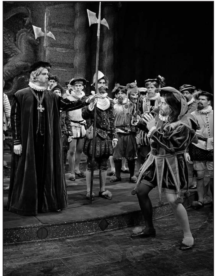
Bob Jones University Opera Association's 1997 Rigoletto

Ironically, the very man whom Rigoletto prompts to seduce other men's wives and daughters becomes the undoing of the jester's own daughter. Victor Hugo writes about the plot and characterization of