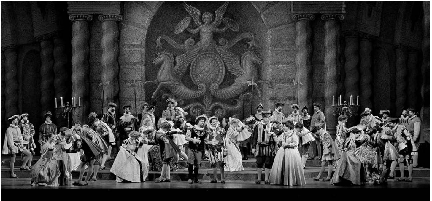
Bob Jones University Opera Association's 1997 Rigoletto

AN EDUCATIONAL OUTREACH OF BOB JONES UNIVERSITY