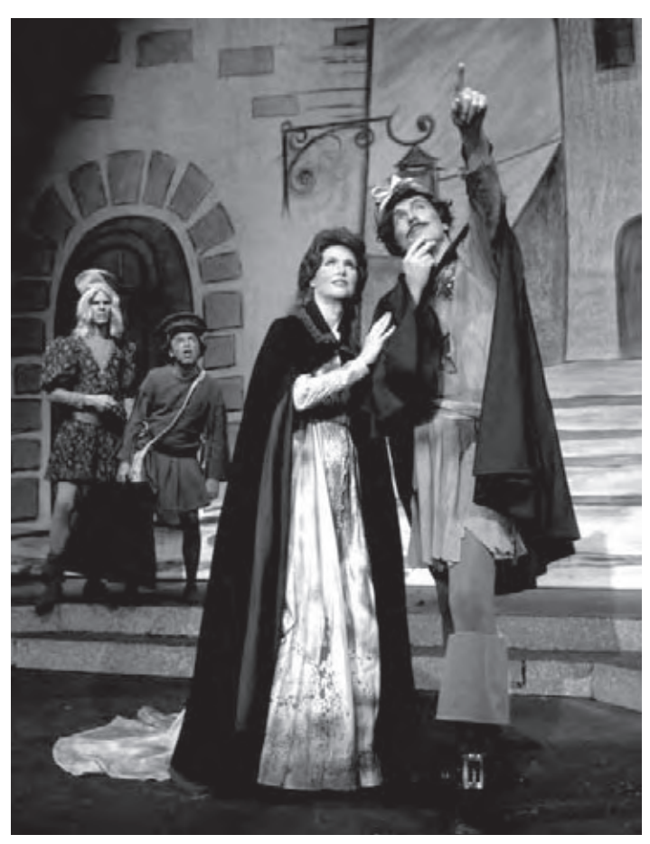
Classic Players 1990

With its emphasis on love and submission, the view of marriage taught by the church stood in stark contrast to the growing tendency in a mercantile world to see marriageable women as marketable commodities. After Petruchio and Baptista have discussed Kate's dowry, Baptista