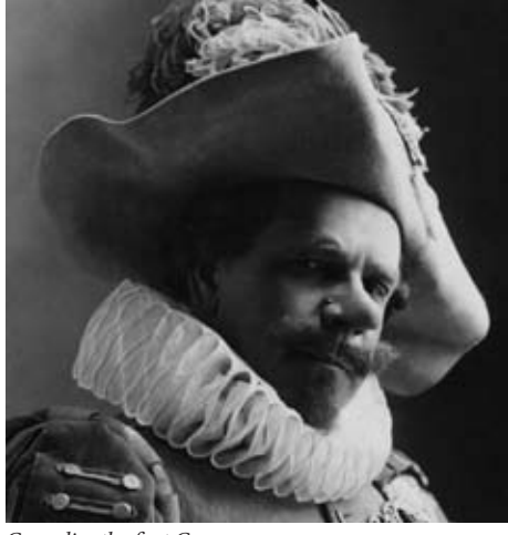
Coquelin, the first Cyrano