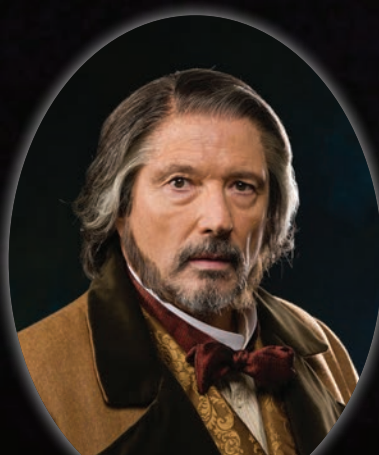
Earl of Kent