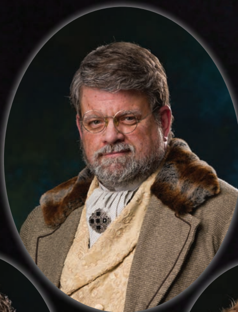
Earl of Gloucester